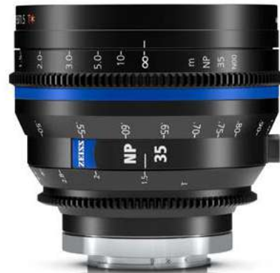
35mm / T1.5