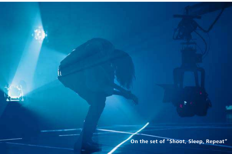
On the set of "Shoot, Sleep, Repeat"