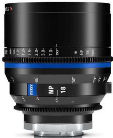
18mm / T1.5