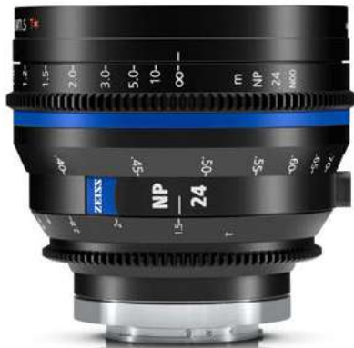
24mm / T1.5