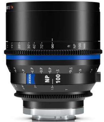
100mm / T1.5