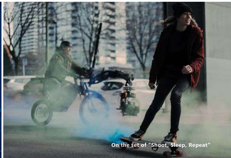
On the set of "Shoot, Sleep, Repeat"